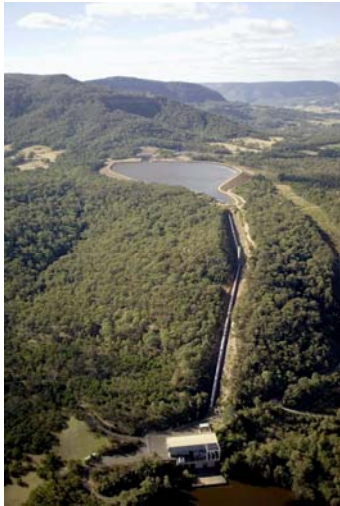
Bendeela Pondage and Bendeela Pumping and Power Station