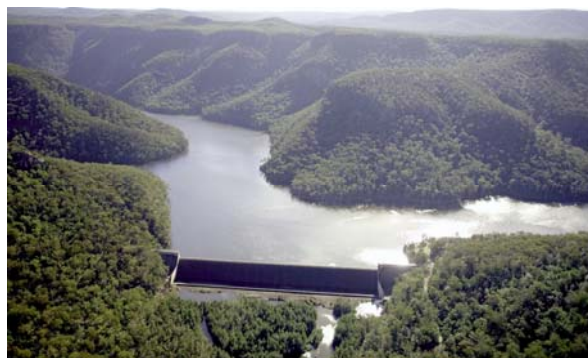
Tallowa Dam, which forms Lake Yarrunga

Pumped storage is an economical source of power generation during times of high demand, and complements the base load power generated by coal-fired plants.